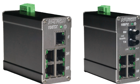
► N-Tron 105 PoE Ethernet switch series