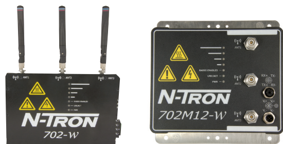
► N-Tron 702-W and 702M12-W Wi-Fi devices