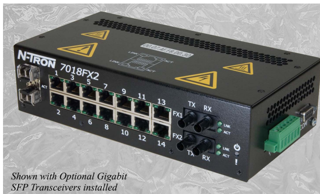
Shown with Optional Gigabit SFP Transceivers installed

DHCP -DHCP Server/Client automates the assignment of IP addresses. DHCP Option 82 assures that if a device on a specific port is replaced, the replacement receives the same IP address as the original device.