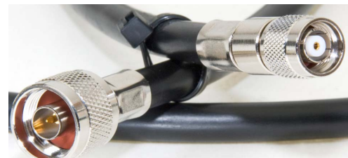
N-TRON ANT-CAB-400-N-RPTNC cable for use with the 702M12-W. N connector is pictured on left and RP-TNC connector on right