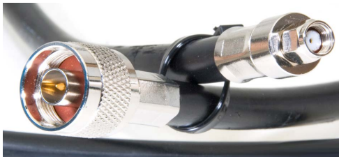
N-TRON ANT-CAB-400-N-RPSMA cable for use with 702-W. N connector is pictured on left and RP-SMA connector on right