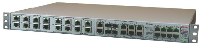
EK32FSD6N-1 with dual 24 VDC inputs and sealed IP50 (no fans!)