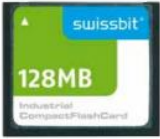
Low Capacity CF Cards

The chart below compares the features of the two products.