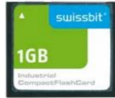
Higher Capacity CF Cards