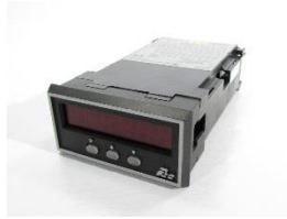
IM Series Meter

The PAX Meters are the designated replacement for the IM Series meters. The chart below compares the features of the two products. Other PAX models may also offer replacement capability; refer to the Product Replacement Guide on our website for additional details regarding specific part numbers.