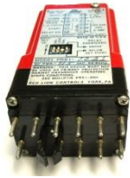
PRS1 Speed Switch

The IFMR Speed Switch is the designated replacement for the PRS1 Speed Switch. The chart below compares the features of the two products.