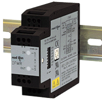
IFMR Speed Switch