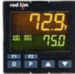
PXU PID Controllers