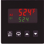
T16/P16 PID Controllers

The PXU PID Controllers are the designated replacement for the T16/P16 PID Controllers. The chart below compares the features of the two products.